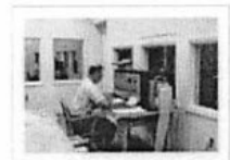
One of Milgram's Research Subjects at the Shocking Machine.

The question of how often patients' consent really reflects their best interests (as they understand those interests) rather than